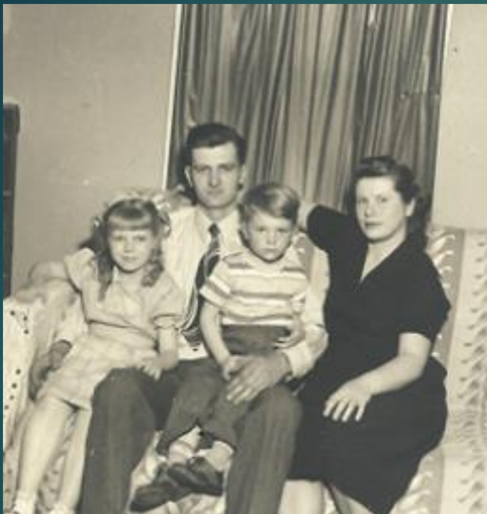
(taken the Fall of their first apple harvest)