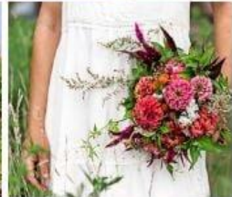
Clockwise from the top: the cabin and general store; visitors who come to pick flowers can make their own bouquets; Jennifer shows two of the farm's heritage pigs a little love.