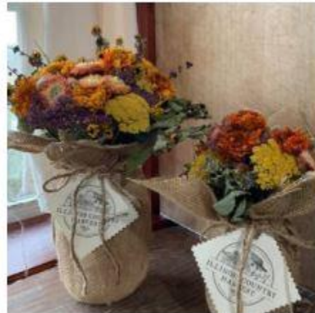
Fall/Thanksgiving Everlasting Dried Flower Harvest Bouquets