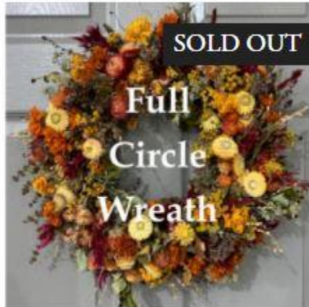
Full Dried Flower Wreath Pick up