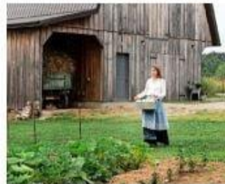
At Illinois Country Harvest, flowers grow along the paths crisscrossing