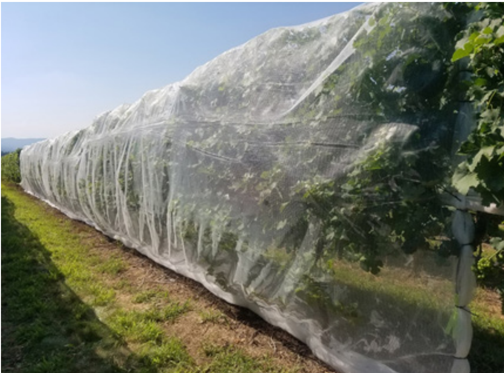
Figure 3. Exclusion netting (DrapeNet, Chazy, New York) used to protect vines from SLF. Note that this netting is tightly closed on the sides and bottom to prevent entry by SLF.

Scraping SLF egg masses and placing them permanently in an alcohol solution (e.g., rubbing alcohol, hand sanitizer) and physical destruction of eggs (smashing) are other approaches to kill SLF. Destruction of eggs might help reduce nymph populations in the spring, but it may not reduce or prevent SLF from infesting a vineyard, especially during the adult stage. It is important to remember that SLF lay their egg masses on many surfaces,