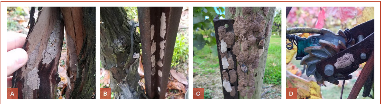
Figure 4. SLF egg masses laid on (A) peeling bark of a grapevine trunk, (B) the inside of metal posts, (C) wooden posts, and (D) vineyard trellis equipment.

including posts, trees, outdoor equipment, and furniture. In vineyards, they are found most commonly underneath cordons, on the vines, and on metal and wooden posts (Figure 4). In addition, the majority of egg masses laid on trees are found above a reachable height (8 feet). As a result, destruction of egg masses is unlikely to significantly affect the bottom-line population in the vineyard. However, some vineyards have reported consistently large numbers of egg masses within their nongalvanized metal posts. Burning these posts with a propane torch, without damaging the grapevine, is a quick way to destroy many egg masses. If you are scraping the egg mass, we recommend you use a hard, flat tool (e.g., putty knife, plastic card) and scrape the egg mass downward into a container. Once finished, submerge all egg masses in alcohol. They can also be smashed, but you need to be sure you are applying pressure to the entire egg mass, or you may miss some eggs. Eggs burst open when they are smashed.